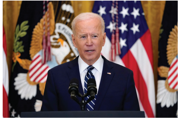
US President Joe Biden speaks about foreign policy at the State Department, March 2021.