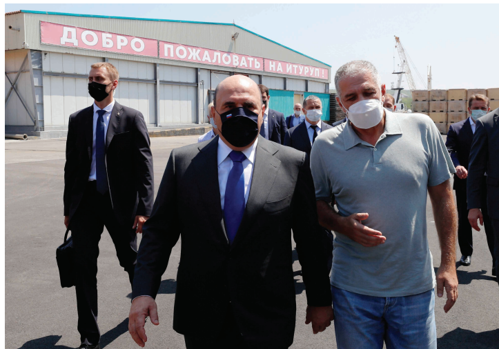
Russian Prime Minister Mikhail Mishustin visits Etorofu Island, a part of the Northern Territories, July 2021.

For Russia to compete with the United States, cooperation with China will become increasingly important. However, even though Russia is cooperating with China, it is trying to avoid becoming totally dependent on China. At present, Russia has no intention of elevating the aforementioned Treaty of Good-Neighborliness and Friendly Cooperation between China and Russia into a military alliance between the two, as this could embroil Russia in a confrontation between