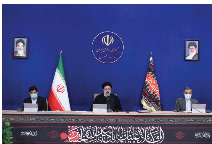
Iranian President Ebrahim Raisi speaking during the first meeting of his cabinet, in Tehran, August 2021.

The circumstances surrounding the Iranian nuclear issue have become even more challenging. Immediately after its inauguration, the new Biden administration sent a positive signal on returning the US to the JCPOA. Indirect talks between the United States and Iran were held from April through the mediation of other JCPOA signatories, but no accord was reached before the Iranian presidential election in June. Although President Raisi vowed, along with Supreme Leader Ayatollah Khamenei, to remain committed to the JCPOA, the new