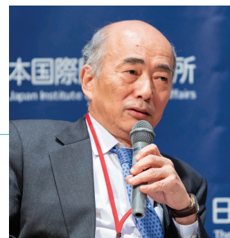
President, The Japan Institute of International Affairs