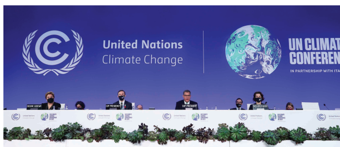
COP26 President Alok Sharma speaks at the UN Climate Change Conference (COP26) in Glasgow, November 2021.

In the EU, progress has been made in rulemaking with a view to establishing an advantage in economic competition related to climate change. In July, the European Commission released the “Fit for 55” policy package to achieve a 2030 reduction target of 55%, setting out a plan for the automotive sector to ban the sale of new internal combustion engine vehicles, including hybrids, by 2035 and introducing carbon border adjustment measures aimed at protecting the international competitiveness of EU industries with stringent climate change measures. These policies attracted significant attention as moves by the EU to take the initiative in environmental policies.