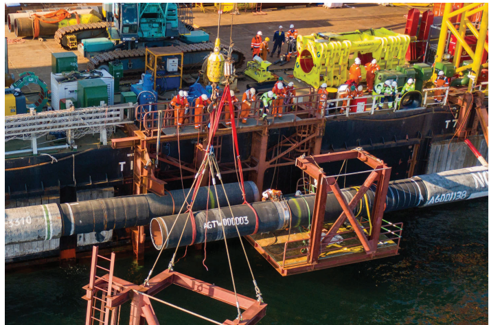
Specialists on the laybarge Fortuna performing an above water tie-in during the final stage of Nord Stream 2 pipeline construction in the Baltic Sea, September 2021.

its involvement in the Indo-Pacific region while experiencing difficulties in its relations with the EU. With the transition of the United States to a new administration, cooperation through NATO, which had been neglected during the Trump years, was once again promoted, but the lack of coordination at the time of US forces withdrawal from Afghanistan sparked criticism of the United States.