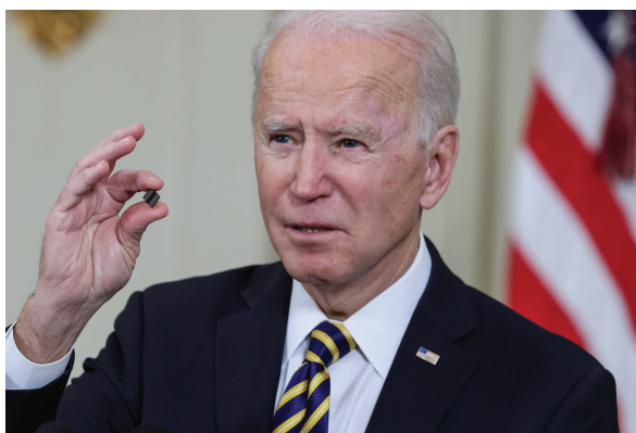
U.S. President Joe Biden delivers holds a semiconductor chip as he speaks prior to signing an executive order, aimed at addressing a global semiconductor chip shortage, February 2021.

As a result, concerns about the risks to cross-border supply chains have increased. The escalating tension between the United States and China, as well as the coronavirus crisis, exacerbated such concerns, and governments have begun to review and restructure their supply chains. In particular, the US government's efforts to restructure supply chains were distinctly oriented toward excluding China. In February, President Biden issued an Executive Order 14017 demanding supply chain reviews for four areas of products (pharmaceuticals, semiconductors, batteries and minerals including rare earths), the results of which were to be reported within 100 days, and for six sectors (defense industrial infrastructure, public health, ICT, energy, transportation and agricultural products), the results of which are to be reported within a year. The results of the review for four product supply chains published in June identified risks such as weak supply chains, malicious supply chains, and inappropriate use of older-generation semiconductors, and made recommendations for strengthening supply chains, including use of the Defense Production Act (DPA).