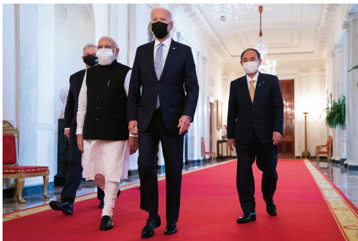
President Joe Biden walks to the Quad summit with, from left, Australian Prime Minister Scott Morrison, Indian Prime Minister Narendra Modi, and Japanese Prime Minister Yoshihide Suga, September 2021.

The new US administration of President Joe Biden has clearly committed to a “free and open Indo-Pacific” (FOIP), and cooperation through the QUAD has been deepened significantly by the holding of summit meetings and the agreement and implementation of concrete cooperation. The United States, the United Kingdom and Australia have launched AUKUS as a new security framework. Faced with the challenges of dealing with the military coup in Myanmar and the coronavirus