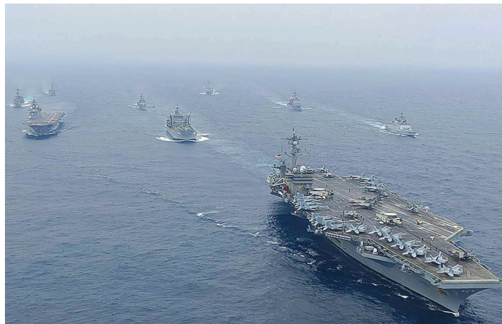
Ships during the second phase of the Malabar naval exercise in which India, Australia, Japan and the U.S are taking part in the Bay of Bengal in the Indian Ocean, October 2021.

Regarding the CPTPP, chaired by Japan in 2021, the United Kingdom formally began the process for accession in June. China formally applied for membership in September, followed by Taiwan. Thailand and South Korea are preparing to apply, and South Korea announced in December that it would be seeking to apply during the Moon administration. The official statement from China stated that China has been a staunch supporter of trade liberalization and an important