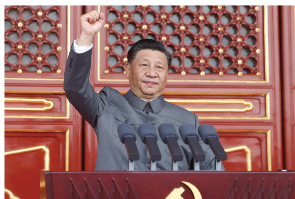
Xi Jinping delivers a speech at a ceremony marking the centenary of the CCP in Beijing, July 2021.

In September, China surprised countries concerned by formally applying to join the Comprehensive and Progressive Agreement for Trans-Pacific Partnership (CPTPP). However, as noted in last year's Strategic Annual Report, President Xi already expressed his willingness to join the CPTPP nearly a year ago, and it can be said that the speech has simply been turned into action. Taiwan announced its own application for CPTPP membership shortly thereafter. Although Taiwan may appear to be following China, it should be noted that Taiwan had been considering and preparing to join the CPTPP for some time. China's application to join the CPTPP poses a challenge for the countries involved, but it is also an expression of China's willingness to participate in the international community and strengthen its economic influence in the Asia-Pacific region (see Chapter 5).