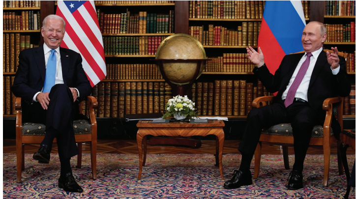
President Joe Biden meets with Russian President Vladimir Putin, in Geneva, Switzerland, June 2021.

If 2020 was the year Russia was forced to deal with an unknown coronavirus, 2021 was the year it sought an exit strategy from the pandemic. Since the beginning of the year, when the coronavirus situation had improved slightly, Russia has made clear its stance of prioritizing the economy and has gradually loosened measures put in place to prevent infections. On the diplomatic