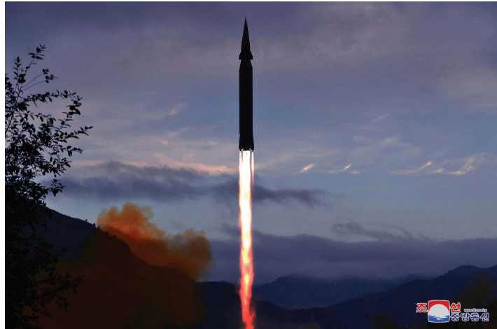
North Korea has successfully tested a new hypersonic gliding missile, September 2021.

Throughout 2021, the security environment in northeast Asia became more challenging. The United States and its allies deployed the largest number of troops in the Western Pacific since the end of the Cold War, while the international community increasingly called for China to maintain peace and stability in the Taiwan Strait as it increased military pressure on Taiwan. Despite its economic difficulties, North Korea pushed ahead with the enhancement of its nuclear