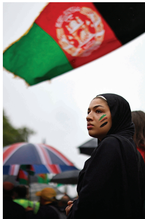
Protesters gather at Marble Arch ahead of a march in solidarity with the people of Afghanistan, in central London, August 2021.

The completion of the withdrawal of US forces from Afghanistan and the restoration of the Taliban regime symbolized the transformation of the regional order in the Middle East in 2021. As the United States shifts its diplomatic and security focus from the Middle East to the Indo-Pacific, China and Russia are increasing their presence in the region, and China in particular is taking part in reorganizing the regional order by strengthening ties with Israel, Gulf Arab oil producers, Iran and Turkey. The US-Iran relationship has entered a new phase with a change of administrations on both sides, and the future of the JCPOA has garnered attention. In addition, security issues including those in North Africa are mounting, such as the ongoing proxy wars and refugee deadlocks in Syria and Yemen, the political upheaval in Tunisia triggered by protests against inadequate responses to the coronavirus crisis, the military coup in Sudan during the transition to civilian rule, and the military conflict in Ethiopia.