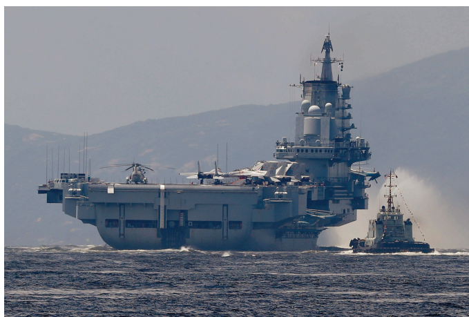
The Liaoning, China's first aircraft carrier, departs Hong Kong, July 2017.

Throughout 2021, Japan expanded its security cooperation with Australia, the UK, France and other countries. In May, at France's request, Japan, the United States and France conducted an island defense drill in Kyushu, simulating landings and land battles. At a June 2+2 meeting between the Japanese and Australian governments, Australian naval vessels became the first foreign warships that the SDF can protect all the time outside the US military. The two governments also agreed in principle