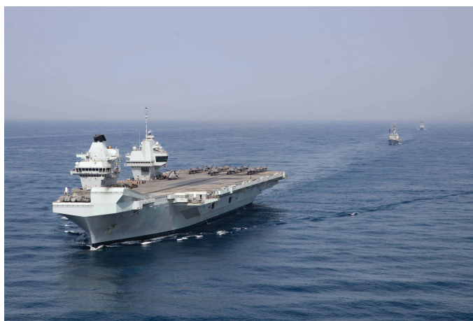
The Royal Navy aircraft carrier HMS Queen Elizabeth (R 08), the guided-missile destroyer USS Halsey (DDG 97) and the guided-missile cruiser USS Shiloh (CG 67) operate in formation in the Gulf of Aden, July 2021.

The United Kingdom, faced with an urgent need to conduct a comprehensive review of its foreign policy strategy after its withdrawal from the EU, has been working to materialize its “Global Britain” initiative. In its Integrated Review 2021 released in March, the UK declared that the Indo-Pacific region is becoming the geopolitical center of the world, and included measures to strengthen ties with countries like Japan, South Korea, Australia and India. In August and September, the new aircraft carrier