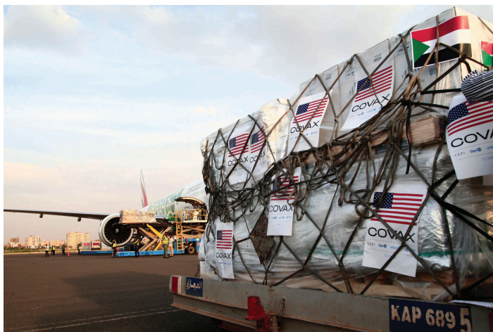
A shipment of vaccines against the coronavirus sent to Sudan by the Covax vaccine-sharing initiative, October 2021.

Multilateralism, which was in a critical state in 2020, was revived by the new US administration of President Joe Biden pursuing a policy of returning to international organizations and agreements and taking the lead in multilateral international collaboration and policy coordination. Concrete progress was made in areas such as the international taxation, but the effectiveness of multilateralism remains to be questioned. As the world continues