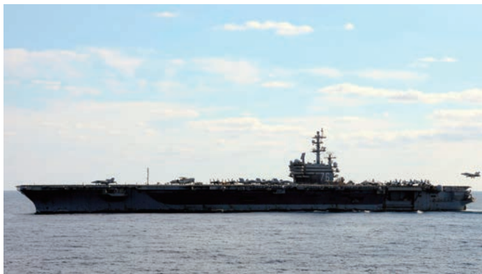
The US nuclear-powered aircraft carrier Ronald Reagan participating in a US-Japan joint exercise, October 2020.

In mid-July 2020, four years since the Philippines v. China arbitral award, the US government expressed its view for the first time that China's assertion on the South China Sea was illegal. At the same time, the US Navy carried out freedom of navigation operations in the South China Sea