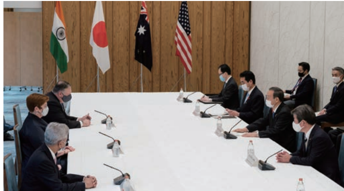
Foreign ministers from Japan, the US, Australia and India attend the meeting at the prime minister's office in Tokyo, Japan, October 2020.

In 2020, as the countries of the region struggled to deal with the coronavirus pandemic, China pursued more authoritarian and assertive domestic and foreign policies on the rule of law and territorial issues, and the US opposition to such moves became more pronounced. Under these