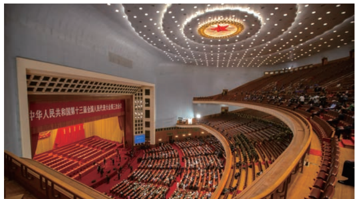
The Third Session of the Thirteenth National People's Congress, China, May 2020.

Since its inauguration, China’s Xi Jinping administration has attached importance to its relationship with the United States and has been striving to build as stable a relationship as possible. On the other hand, “The Chinese Dream” and “Great Rejuvenation of the Chinese Nation” became