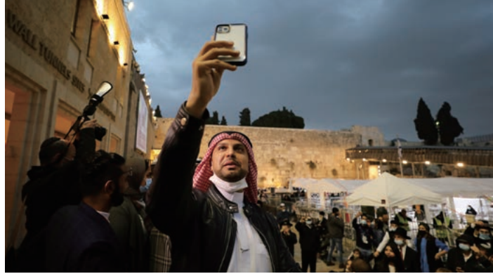
A delegation from the United Arab Emirates and Bahrain visited the Judaism's holiest prayer site in Jerusalem's old city, December 14, 2020.

In 2020, the Middle East was hit by an outbreak of the coronavirus disease like other countries, during which the instability and vulnerability of the region became apparent. Against the backdrop of a multilayered “power vacuum” in the region, the struggle for supremacy by