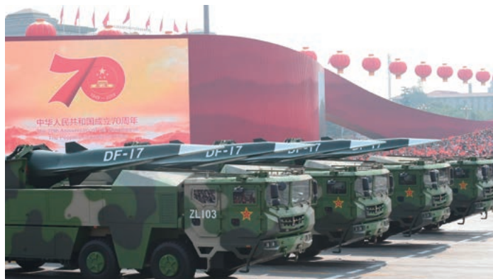
DF-17s taking part in a military parade celebrating the 70th founding anniversary of the People's Republic of China (PRC), October 1, 2019.

As mentioned above, the relationship between the United States and China in 2020 became harshly adversarial, which some describe as the “New Cold War.” As the military confrontation between the United States and China over Taiwan deepened, there were growing concerns