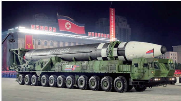
DPRK’s new ICBM (untested) unveiled during the military parade marking the 75th anniversary of WPK, October 10, 2020.