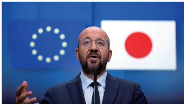
European Council President Charles Michel speaks during a news conference following an EU-Japan videoconference summit, May 2020.

Connectivity and sustainable development are the first areas where Japan and Europe can further cooperate in the Indo-Pacific. The concept of ‘quality infrastructure investment,’ led by Japan, has won widespread support at G7 and G20 summits and is encapsulated in the connectivity partnership between Japan and the EU. This concept is expected to play an important role in rebuilding the supply chains disrupted by the COVID-19 crisis. The EU has expressed concerns about China’s aggressive implementation of its BRI and resulting debt trap, as well as its growing influence over Central and Eastern European countries, as these may promote authoritarianism and potentially undermine European unity. Japan and Europe should put forward the idea of quality infrastructure and sustainable connectivity as an alternative to the BRI and promote a wide range of projects throughout the Western Balkans, Eastern Europe, Central Asia, Indo-Pacific, and Africa.