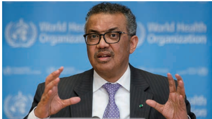
Director-General of the WHO Tedros attends a conference on the outbreak of COVID-19, March 2020.

General has not been elected as of the end of 2020. Regarding the pandemic, President Trump has criticized China over its handling, drawing counterargument from China and leading to a blame game between the two countries. The United States strongly criticized the WHO that it was accommodating to China, suspended the payment of its contributions in April and announced its withdrawal in July. At the United Nations, Secretary General António Guterres called for an immediate ceasefire in conflict areas in March, but adoption of the Security Council resolution to the same effect was delayed until July due to a disagreement between the United States and China over whether it should include reference to the WHO. These developments at various international organizations revealed in broad daylight the absence of US leadership and the dysfunction of international organizations stemming from the confrontation between the United States and China amid the pandemic.