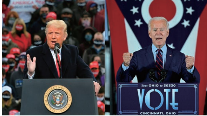
President Trump speaks during a campaign rally in New Hampshire and Democratic Presidential candidate Biden delivers remarks at a voter mobilization event in Ohio, October 2020.

Deteriorating US-China relations have become a premise for discussing global affairs today. A harsh view on China is now shared among bipartisan policy makers in the US, and there is no sign of easing of the confrontation between the two countries in the short term under the Biden administration following