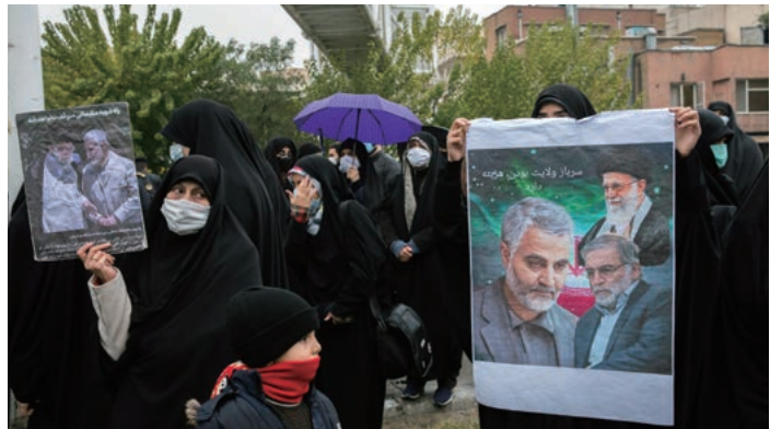
A protest in Tehran on Saturday, November 28, 2020, against the assassination of Mohsen Fakhrizadeh, Iran's top nuclear scientist.

On the other hand, the confrontation between the United States and Iran continued to escalate. The Trump administration declared US withdrawal from the JCPOA in May 2018 and gradually strengthened its own sanctions against Iran. Following the