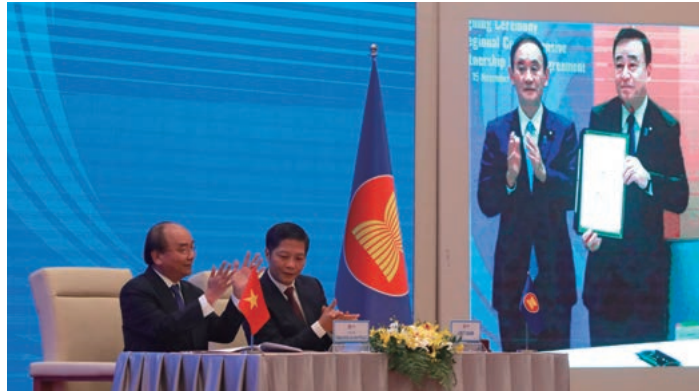
15 Asian nations signed the RCEP Agreement, November 2020.

trade practices are very high for China to meet. Unless China renounces its rights as a developing country and boldly promotes domestic structural reforms, it will be extremely difficult for China to immediately participate in TPP. Although the intent of this statement is not clear, there are various possibilities behind his expression of interest in TPP where the United States is absent.