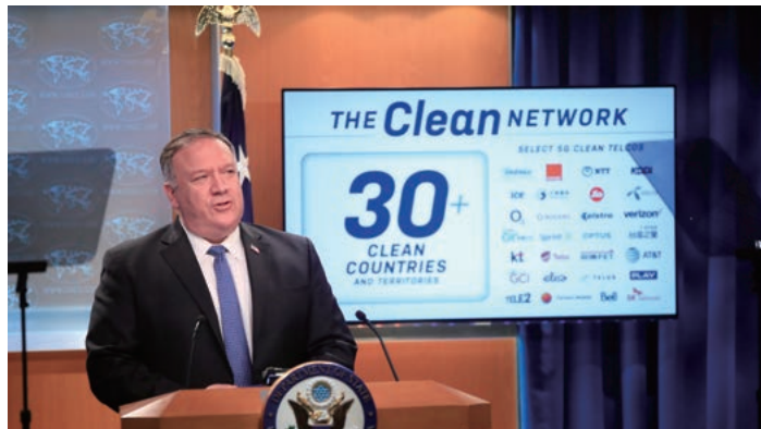
US Secretary of State Mike Pompeo announced the Clean Network Initiative, August 5, 2020.

about collection of personal data through Chinese apps, and began to remove them. In August, the US government banned trading with TikTok, a popular video-sharing app. This was because TikTok's automatic collection of users' personal information gives the Chinese Communist Party access to information on US citizens.