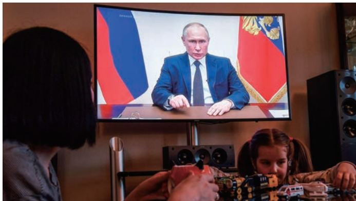
President Vladimir Putin gives a televised speech on the coronavirus outbreak, April 2020.

2020 was the year of the coronavirus pandemic for Russia. As of the end of December 2020, the number of novel coronavirus infection cases in Russia stood at 3,159,297, the fourth highest number in the world, with 57,019 deaths. The number of new cases per day exceeded 20,000 since mid-November, with the death toll hovering around 500 to 600. The second wave since October is raging in Russia. The pandemic had a major impact on Russia's economy, politics and diplomacy in 2020.