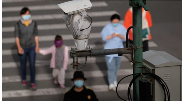
A CCTV security surveillance camera monitoring people's movement during the COVID-19 outbreak in Beijing, May 2020.

The novel coronavirus pandemic has accelerated moves to review international interdependence from the perspective of power politics. Shocks in the low tier of supply chains caused delays and interruptions in the supply of parts and materials, hampering the stable supply of finished