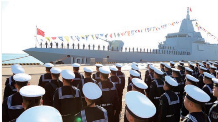
The commissioning ceremony of China's first Type 055 guided-missile destroyer, January 12, 2020.

In 2020, Japan and China initially sought to improve their relations, but this movement stalled. Japan also worked with the United States to improve the situation in which its supply chain is overly dependent on China, but the review of its national security strategy did not make enough progress. Meanwhile on the Korean Peninsula, confrontations at the local level developed in anticipation of the US presidential election.