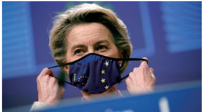
European Commission President Ursula von der Leyen wears a mask after giving a statement on the outcome of the Brexit negotiations, December 2020.

The intensifying US-China hegemonic competition and the worsening perception of China due to the COVID-19 pandemic have brought about a strategic change in Europe to turn its attention towards the Indo-Pacific. Several European countries have successively put in place their Indo-Pacific strategies,