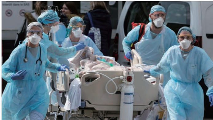
The outbreak of COVID-19 put French medical staff under severe strain, March 2020.

The transnational outbreak of a novel coronavirus infection (COVID-19) brought about the greatest impact on the world affairs in 2020. The COVID-19 pandemic is a global issue that affects multiple sectors of the economy and society of each country and region, and has had a major impact on the