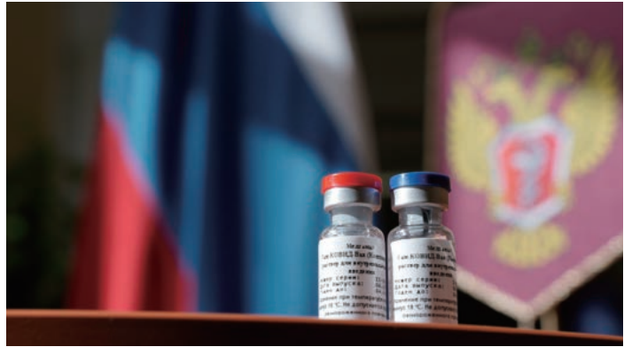
Sputnik V is the world's first vaccine against COVID-19 registered by the Russian Government, August 2020.

However, there is certain criticism about Russia's attitude. One is the hasty development of vaccines. Doubts about the safety of vaccines linger as their approval preceded the final results of clinical trials. Another aspect is that Russia does not participate in the COVAX facility, an international framework led by the WHO to provide vaccines to developing countries. While expressing certain appreciation to the role of COVAX, Russia refused to participate, saying that Russia, which had its own vaccine, did not need or intend to buy foreign vaccines.