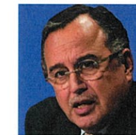
H.E. Nabil FAHMY

Dean of the School of Global Affairs and Public Policy and Professor of Practice, the American University in Cairo / Former Foreign Minister of the Arab Republic of Egypt