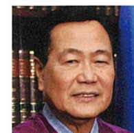
Antonio T. CARPIO Retired Justice, Supreme Court of the Philippines