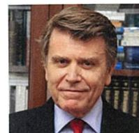
Thierry de MONTBRIAL

Executive Chairman, French Institute of International Relations (Ifri)