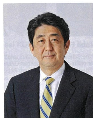
H.E. ABE Shinzo Prime Minister of Japan

Mr. ABE Shinzo is the Prime Minister of Japan and the President of the Liberal Democratic Party (LDP). He is a member of the House of Representatives (Elected 9 times). He served as Chief Cabinet Secretary from 2005 to 2006 and as Prime Minister and President of LDP from 2006 to 2007. He assumed office in 2012.