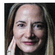
Avril HAINES Former White House Deputy National Security Advisor / Former Deputy Director of the U.S. Central Intelligence Agency

Avril Haines is a Senior Research Scholar at Columbia University, a Senior Fellow at the Johns Hopkins University Applied Physics Laboratory, a Nonresident Senior Fellow at the Brookings Institution, and a principal at WestExec Advisors. During the last Administration, Ms. Haines served as Assistant to the President and Principal Deputy National Security Advisor, and as such, chaired the Deputies Committee, the administration's principal forum for formulating national security and foreign policy. She also served as the Deputy Director of the Central Intelligence Agency and Legal Adviser to the National Security Council, in addition to other senior legal positions at the State Department and the U.S. Senate Committee on Foreign Relations. Ms. Haines received her bachelor's degree in Physics from the University of Chicago, received a law degree from Georgetown University Law Center, and founded and ran a bookstore café for five years while engaged in community service in Baltimore. She was appointed by the President to be a Member of the National Commission on Military, National, and Public Service, and serves on a number of boards and advisory groups, including the Nuclear Threat Initiative's Bio Advisory Group, the Board of Trustees for the Vodafone Foundation, and the Refugees International Advisory Council.