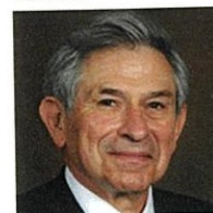
Paul WOLFOWITZ Visiting Scholar, the American Enterprise Institute (AEI) / Former President, World Bank