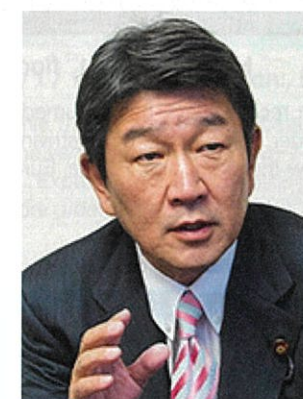
H.E. MOTEGI Toshimitsu Minister for Foreign Affairs of Japan

Mr. Motegi Toshimitsu is a member of the House of Representatives belonging to the Liberal Democratic Party and currently serves as Minister for Foreign Affairs of Japan. He graduated from the University of Tokyo, and earned his Master's Degree from Harvard University. He served as Chairman of Policy Council of the LDP; Minister of Economy, Trade and Industry; and Minister of State for Economic and Fiscal Policy. He assumed the current position in September 2019.