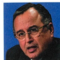
H.E. Nabil FAHMY Dean of the School of Global Affairs and Public Policy and Professor of Practice, the American University in Cairo / Former Foreign Minister of the Arab Republic of Egypt

Fahmy is a career diplomat (1976-2011) and the former Foreign Minister of Egypt (2013-2014) during which he steered the course of Egypt's diplomacy during a time of immense challenge. He served as Ambassador to Japan (1997-1999) and the United States (1999-2008). His work focused on international and regional security, disarmament and non-proliferation, conflict resolution and Arab-Israeli diplomacy. He was also the Chairman of the United Nations Advisory Board on Disarmament Matters, and the Vice Chairman of the United Nations General Assembly's first committee dealing with disarmament and international security. He was also a member of the Egyptian Delegation to the 1991 Madrid Peace Conference, the Review Conferences of the Treaty on the Non-Proliferation of Nuclear Weapons and many other multilateral events. Nabil Fahmy also founded the School of Global Affairs and Public Policy (GAPP) at The American University in Cairo (AUC) in 2009.