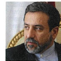
Seyyed Abbas ARAGHCHI

Deputy Foreign Minister for Political Affairs, Iran / Former Ambassador of Iran to Japan