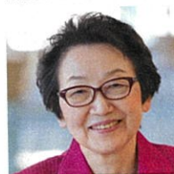
H.E. Yoriko KAWAGUCHI Visiting Professor, Musashino University / Former Minister for Foreign Affairs of Japan