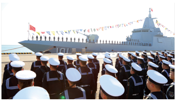
The commissioning ceremony of China's first Type 055 guided-missile destroyer, January 12, 2020.

In 2020, Japan and China initially sought to improve their relations, but this movement stalled. Japan also worked with the United States to improve the situation in which its supply chain is overly dependent on China, but the review of its national security strategy did not make enough