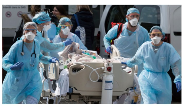
The outbreak of COVID-19 put French medical staff under severe strain, March 2020.

The transnational outbreak of a novel coronavirus infection (COVID-19) brought about the greatest impact on the world affaires in 2020. The COVID-19 pandemic is a global issue that affects multiple sectors of the economy and society of each country and region, and has had a major impact on the