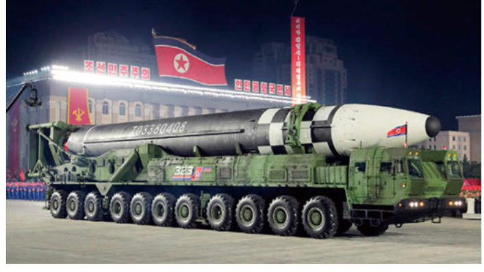
DPRK's new ICBM (untested) unveiled during the military parade marking the 75th anniversary of WPK, October 10, 2020.

to be trying to create a favorable environment for its negotiations with the United States while keeping the confrontation at a local level through the sharing of roles between the "pacificatory" Kim Jong-un, chairman of the ruling WPK and the "belligerent" Kim Yo-jong, his younger sister.