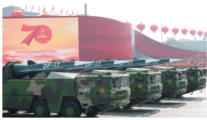
DF-17s taking part in a military parade celebrating the 70th founding anniversary of the People's Republic of China (PRC), October 1, 2019.

As mentioned above, the relationship between the United States and China in 2020 became harshly adversarial, which some describe as the "New Cold War." As the military confrontation between the United States and China over Taiwan deepened, there were growing concerns