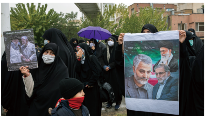
A protest in Tehran on Saturday, November 28, 2020, against the assassination of Mohsen Fakhrizadeh, Iran's top nuclear scientist.

On the other hand, the confrontation between the United States and Iran continued escalate. The Trump administration declared US withdrawal from the JCPOA in May 2018 and gradually strengthened its own sanctions Iran. Following the against