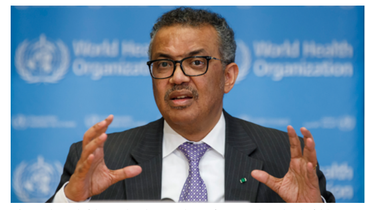
Director-General of the WHO Tedros attends a conference on the outbreak of COVID-19, March 2020.

international organizations revealed in broad daylight the absence of US leadership and the dysfuntion of international organizations stemming from the confrontation between the United States and China amid the pandemic.