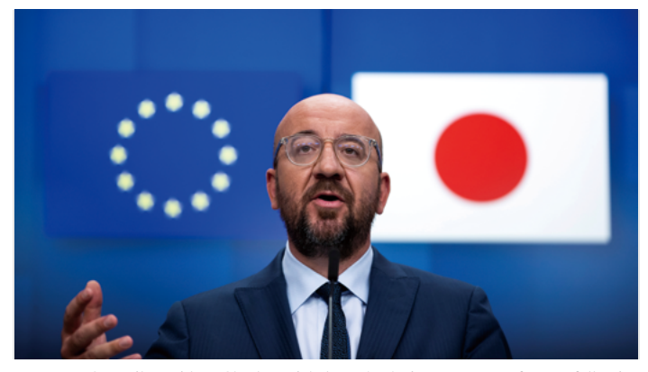
European Council President Charles Michel speaks during a news conference following an EU-Japan videoconference summit, May 2020.

Connectivity and sustainable development are the first areas where Japan and Europe can further cooperate in the Indo-Pacific. The concept of 'quality infrastructure investment,' led by Japan, has won widespread support at G7 and G20 summits and is encapsulated in the