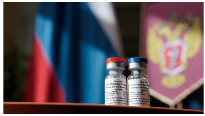
Sputnik V is the world's first vaccine against COVID-19 registered by the Russian Government, August 2020.

However, there is certain criticism about Russia's attitude. One is the hasty development of vaccines. Doubts about the safety of vaccines linger as their approval preceded the final results of clinical trials. Another aspect is that Russia does not participate in the COVAX facility,