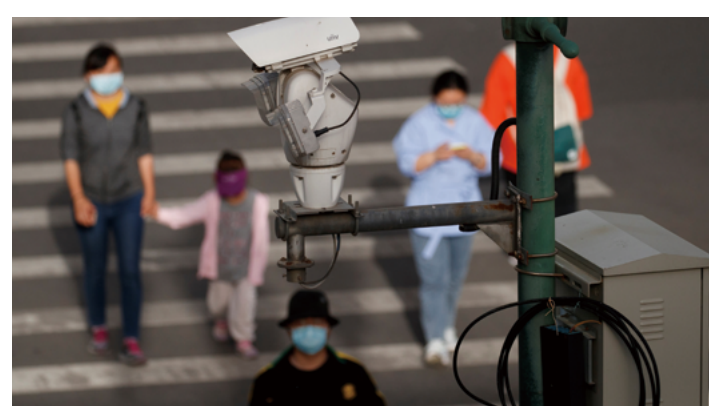
A CCTV security surveillance camera monitoring people's movement during COVID-19 outbreak in Beijing, May 2020.

The novel coronavirus pandemic has accelerated moves to review international interdependence from the perspective of power politics. Shocks in the low tier of supply chains caused delays and interruptions in the supply of parts and materials, hampering the stable supply of finished