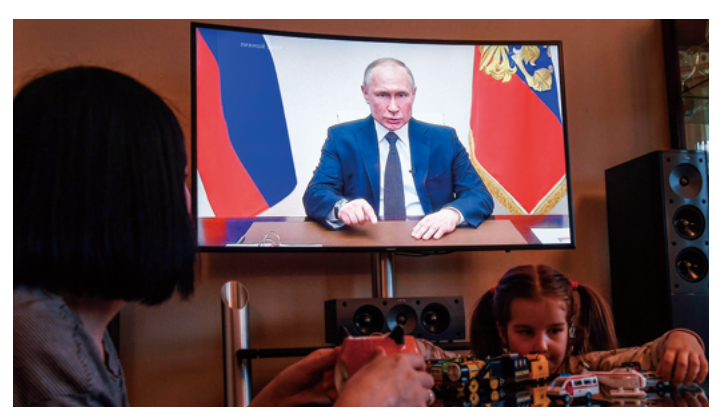
President Vladimir Putin gives a televised speech on the coronavirus outbreak, April 2020.

2020 was the year of the coronavirus pandemic for Russia. As of the end of December 2020, the number of novel coronavirus infection cases in Russia stood at 3,159,297, the fourth highest number in the world, with 57,019 deaths. The number of new cases per day exceeded 20,000 since