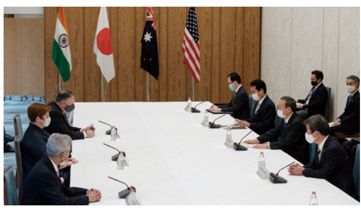
Foreign ministers from Japan, the US, Australia and India attend the meeting at the prime minister's office in Tokyo, Japan, October 2020.

In 2020, as the countries of the region struggled to deal with the coronavirus pandemic, China pursued more authoritarian and assertive domestic and foreign policies on the rule of law and territorial issues, and the US opposition to such moves became more pronounced. Under these