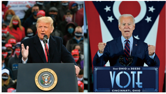
President Trump speaks during a campaign rally in New Hampshire and Democratic Presidential candidate Biden delivers remarks at a voter mobilization event in Ohio, October 2020.

Deteriorating US-China relations have become a premise for discussing global affairs today. A harsh view on China is now shared among bipartisan policy makers in the US, and there is no sign of easing of the confrontation between the two countries in the short term under the Biden administration following