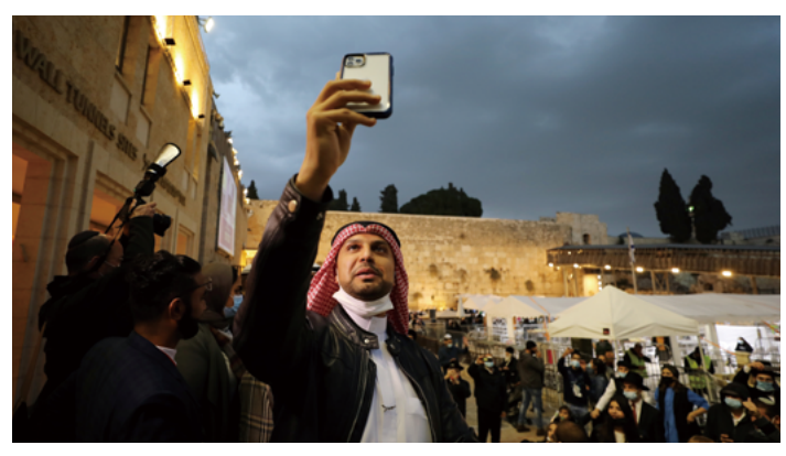
A delegation from the United Arab Emirates and Bahrain visited the Judaism's holiest prayer site in Jerusalem's old city, December 14, 2020.

In 2020, the Middle East was hit by an outbreak of the coronavirus disease like other countries, during which the instability and vulnerability of the region became apparent. Against the backdrop of a multilayered "power vacuum" in the region, the struggle for supremacy by