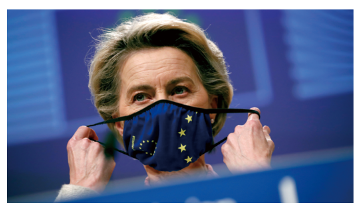
European Commission President Ursula von der Leyen wears a mask after giving a statement on the outcome of the Brexit negotiations, December 2020.

The intensifying US-China hegemonic competition and the worsening perception of China due to the COVID-19 pandemic have brought about a strategic change in Europe to turn its attention towards the Indo-Pacific. Several European countries have successively put in place their Indo-Pacific strategies,