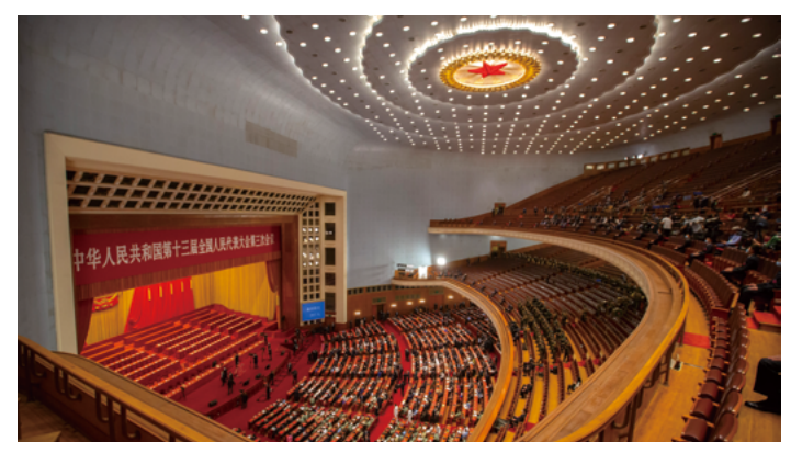
The Third Session of the Thirteenth National People's Congress, China, May 2020.

Since its inauguration, China's Xi Jinping administration has attached importance to its relationship with the United States and has been striving to build as stable a relationship as possible. On the other hand, "The Chinese Dream" and "Great Rejuvenation of the Chinese Nation" became